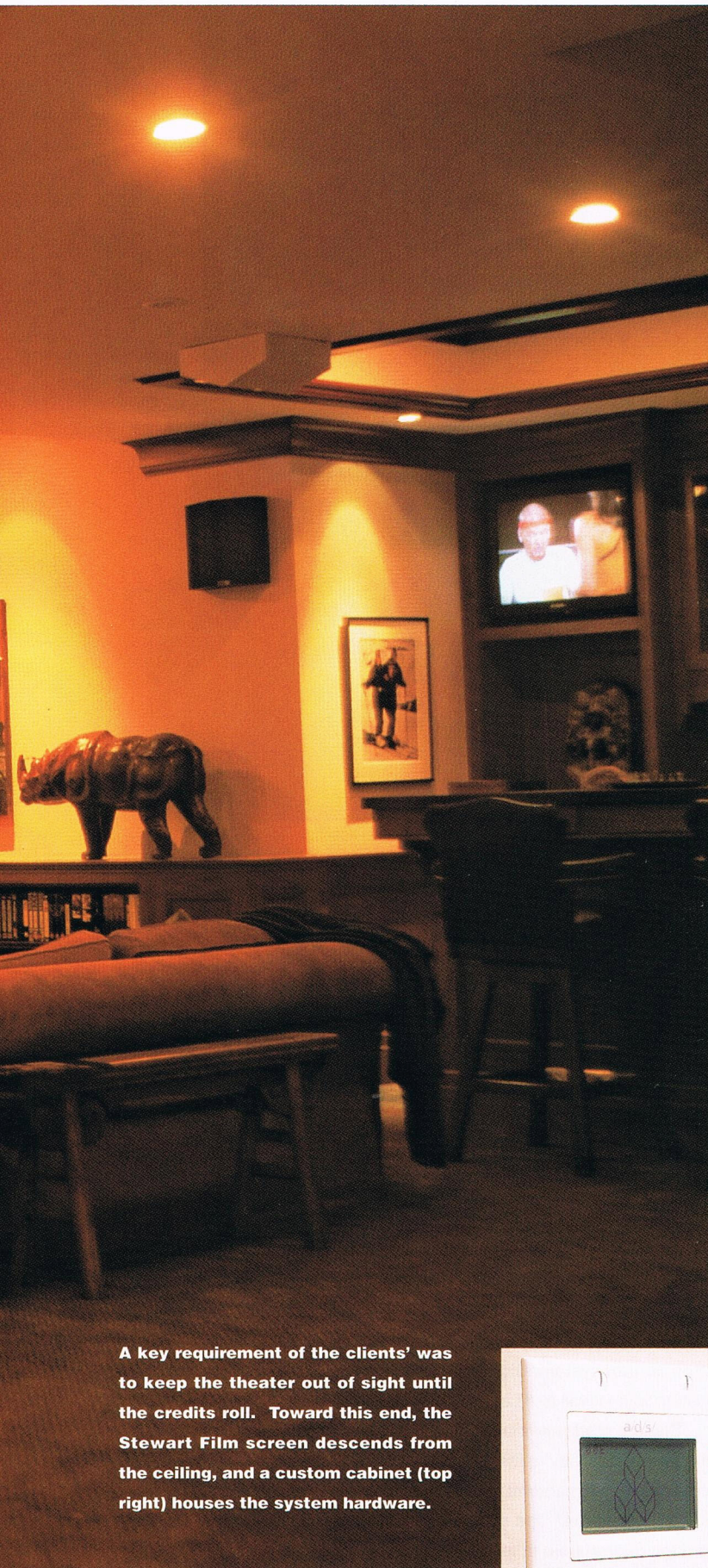
A key requirement of the clients' was to keep the theater out of sight until the credits roll. Toward this end, the Stewart Film screen descends from the ceiling, and a custom cabinet (top right) houses the system hardware.